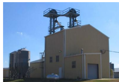
Poultry Research Feed Mill

The poultry producer must know the nutritional requirements of the bird's function; either egg production or meat production. After determining the nutritional requirements, the poultry producer should look into the availability and cost of appropriate feedstuffs. It is also critical that the poultry nutritionist know the limitations associated with each ingredient. Some ingredients may have anti-nutritional properties which limit their usage in poultry diets.